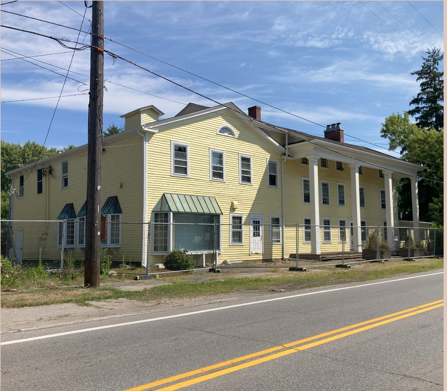
Unionville Tavern Unionville, Ohio Built 1798